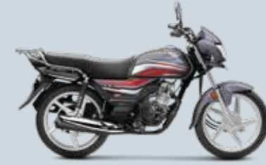
Geny Grey Metallic