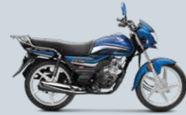
Athletic Blue Metallic