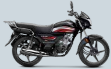
Black with Red